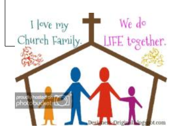
Where everybody is somebody and Jesus Christ is Lord.